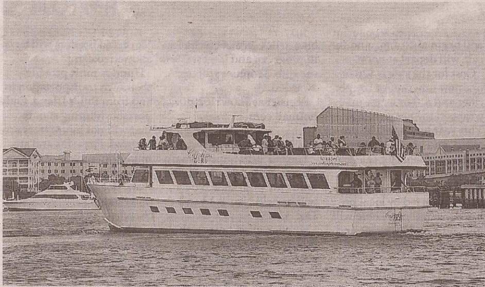
The Carolina Girl yacht recently hosted children from the Epworth Home.