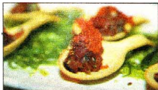
Tuna tartare is an elegant selection for a refined reception menu.

Many event companies, like Duvall Catering & Event Design, showcase sample pictures of food, menus, décor and venues for the bride to be, making it simple and accessible for couples who want to view from the comfort of their homes. The Web site is www.events-byduvall.com .